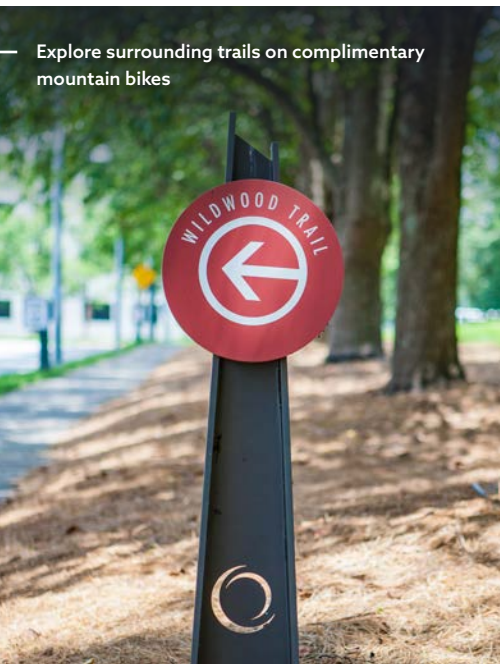
— Explore surrounding trails on complimentary mountain bikes